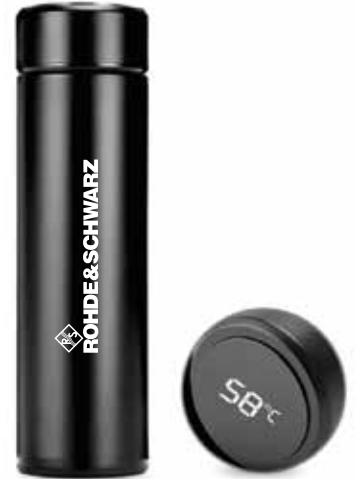
Temperature Display Indicator thermo